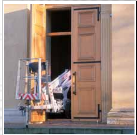
DINO I05T features single door access.