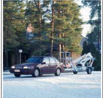
Lightweight design allows towing by a variety of vehicles.