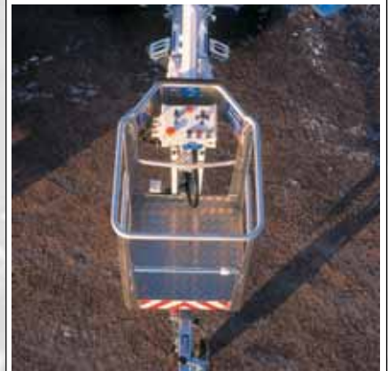
Aluminum platform offers easy to operate 2-speed control levers.

DINO® and Dino Lift® are trademarks registered by the company Dino Lift Oy.